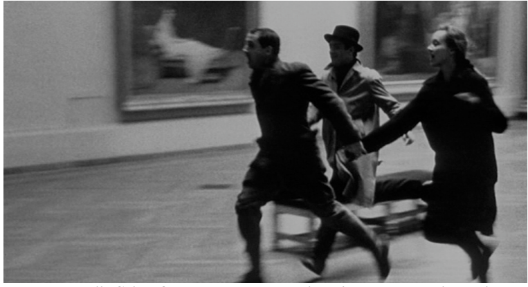
"The run through the Louvre": Stills from the sequence in The Dreamers in which extracts from Jean-Luc Godard's Bande à part are intercut with Bertolucci's colour replication of the original.